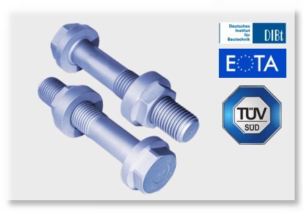
Complete Offshore Hardware Kits Proven and certified IHF headbolts, studbolts, IHF roundnuts up to M80 (3").